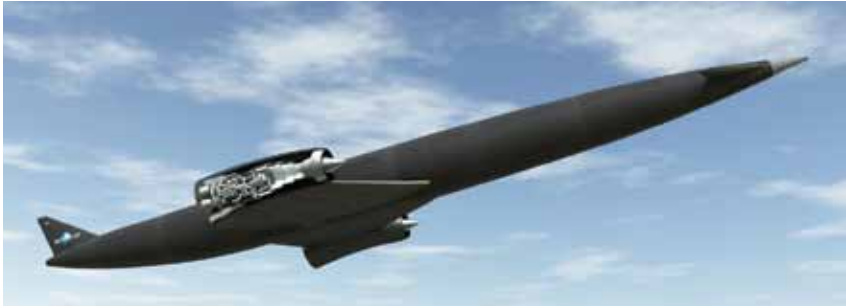
Fig. 3—Artist rendering of the spaceplane. The engine is cutaway to show its size in relation to the full spaceplane.

personal airplane, what do you think they would be able to see as they look out a window, looking in the direction the plane is flying? Looking straight down at the ground?