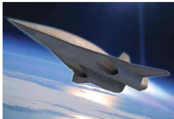
Fig. 1—Artist rendering of the SR-72

plant on this aircraft will propel the airplane to Mach 6. The turbo-jet engine in the illustration is similar to the one that powered the SR-71, and it will take the plane from airfield to a speed of Mach 3. At this speed, the air flow going into the engine will be so compressed that it will be perfect air pressure to allow the airplane's ramjet engine to push propulsion up to Mach 6. Figure 2 shows both engines sharing the same air inlet and nozzle output. This plane is being designed to fly at very high altitudes