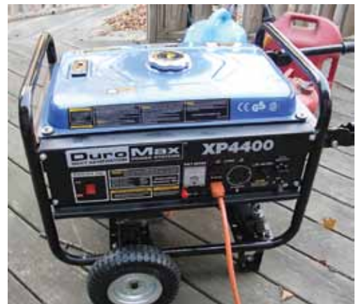
Photo 2—A portable generator can restore some electricity to your home. Generators should always be operated outside and away from windows to keep fumes from entering the home.