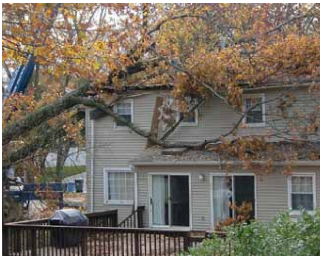
Photo 1—The high winds of a storm like Sandy can push over trees into homes, cars, and utility poles. Even in areas with underground utilities, above ground power lines can still be broken, causing local electrical blackouts.

New York's Rockland County. As I write, we have been without electricity for six days. Hurricane Sandy knocked out our electricity on Monday October 29, at 5:28 P.M. Rockland County and many other parts of New York are now labeled a disaster area and we are being told that our electricity might not be back until almost the middle of November. (Update: Our electricity was restored on November 5.)