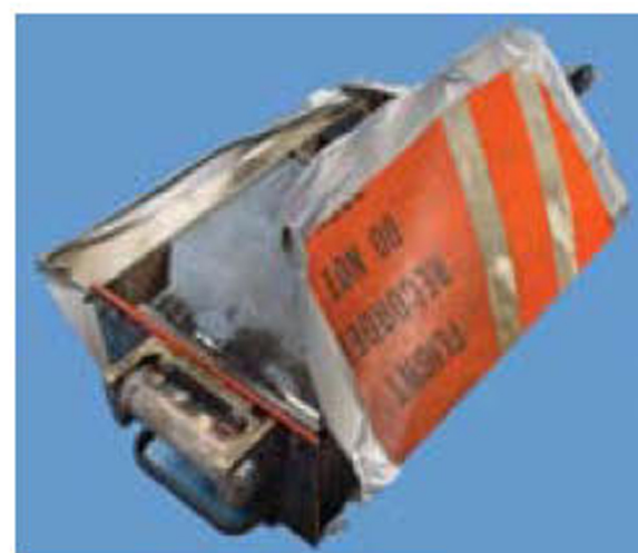
Photo 3 (left)—CVR from a plane that crashed, cut open to access its data

Star Navigation Systems Group Ltd. has recently announced its new Terrastar in-flight monitoring system. The company hopes to sell its system initially as an extra black box that will transmit the data that it collects during the actual airplane flight. Company leaders feel that their system can pick up flight anomalies and provide the information to the