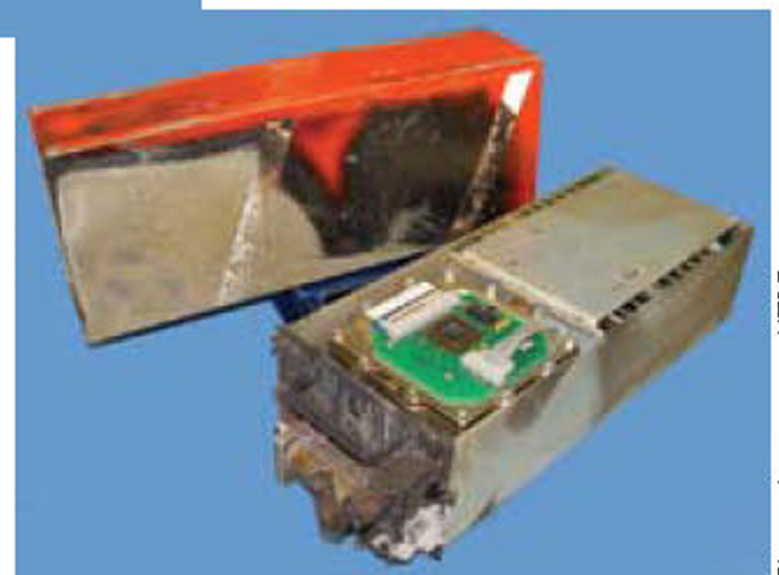
Photo 4 (below)— The FDR from the same plane, removed from its casing

flight crew and ground crew while the plane is flying long before a catastrophic problem causes an airplane to crash. (See Photo 5.) At the time