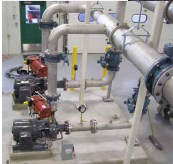
Figure and photos courtesy Rentricity Inc.

because the city now generates more power than its businesses and citizens use. You will find a link to a Rentricity video online at http://www.technologytoday.us/page13.html .