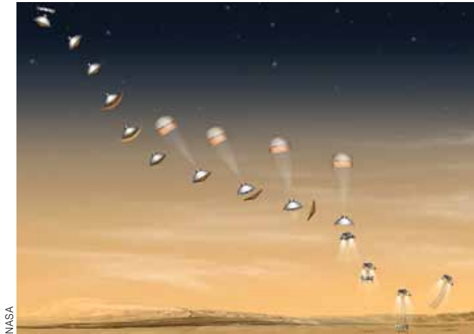
Photo 3—The heat shield's shape provides the aerodynamic characteristics necessary for the aeroshell to catch Mars's thin air and fly to its landing location.

What NASA accomplished with Curiosity's landing is truly amazing. A NASA video entitled "Seven Minutes of Terror," found at www.youtube.com/watch?v=Ki_Af_o9Q9s&feature=player_embedded , will give you a good sense of the orchestration of the aeroshell landing. You will find links to other NASA videos online at www.technologytoday.us/page13.html .