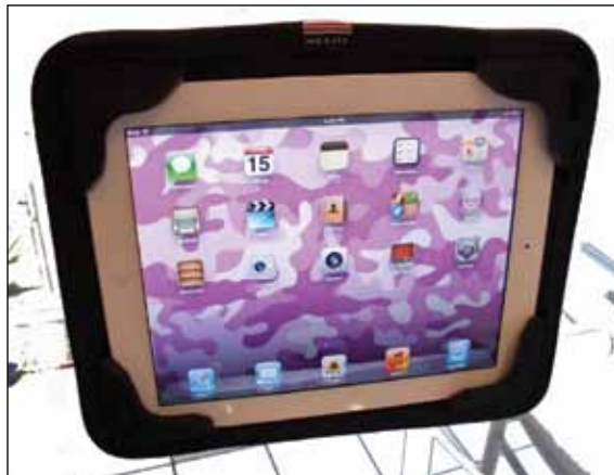
Photo 3—The four corners that hold an iPad in this case offer some frontal protection from most drops, but they also block easy access to the edge controls on the tablet.

Many people have taken the time to record video that shows the protective nature of G-Form's Reactive Protection Technology. You can find links to some of these videos at www.technologytoday.us/page13.html .