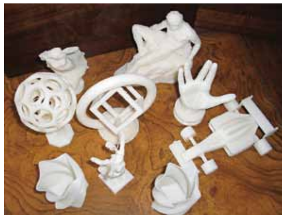
Photo 2—I downloaded the STL files for the projects that I built from www.myminifactory.com .

From my exploration into the world of 3D printing as a builder, it is clear that any tech-savvy 12-year-old could quickly start building 3D objects using the thousands of free designs already available for download on the Internet. (See Photo 2.) Online you can find STL files to build toys, jewelry, costumes, gadgets, miniatures of museum sculptures, cellphone cases, and any other plastic object that has already popped into someone’s mind. The “easy-to-