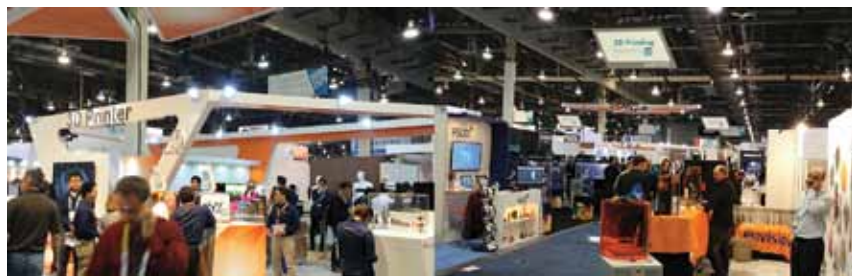
Photo 1—A small part of the 2015 CES 3D Printing Tech Zone

or incremental technology advances. CES has been the incubator for many of my columns. (Getting a magazine through the printing and mailing process takes time, and that is why this CES-themed column, which was written in January, didn’t reach your hands until March.)