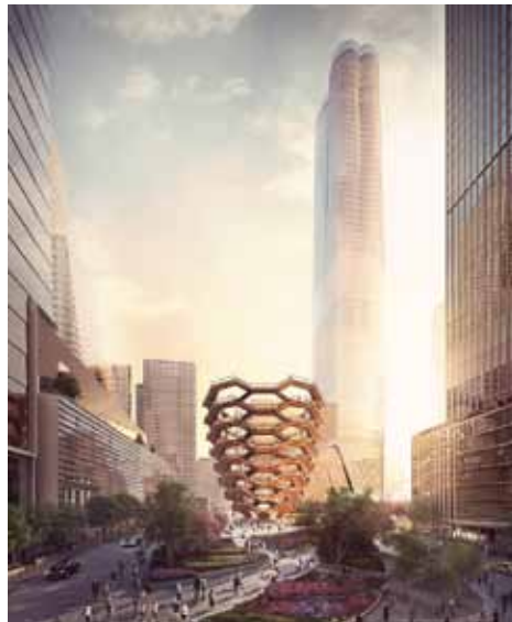
Photo 1— The bronze-colored tower is an interactive architectural art structure of staircases for people to climb.

now building Vessel (Photo 2.) It is an observation tower that will become a NYC landmark. Vessel is de-