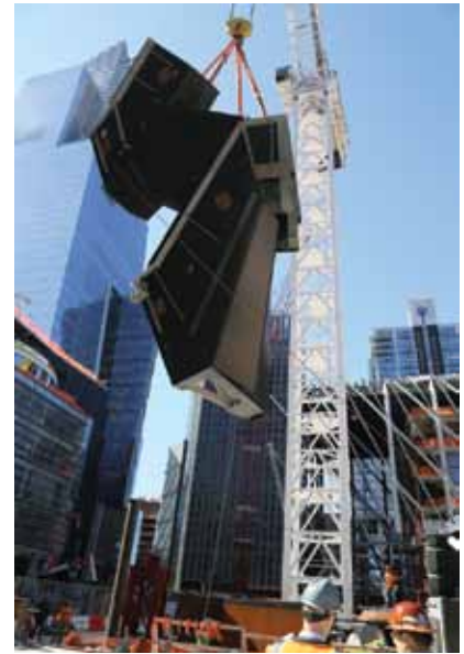
Photo 5—Vessel is a giant jigsaw puzzle that is being shipped from Italy for onsite assembly at the construction site.

narrower at its base than it is at its top. Specific design elements and construction materials will be determined by your teacher. ©