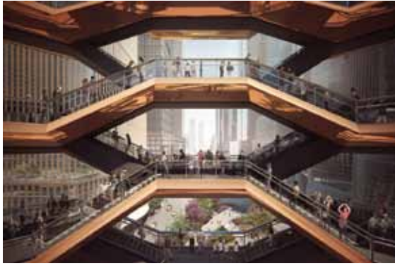
Photo 4— The landings of the different staircases all give you different views of the surrounding city.

full load of the structure down to its foundation.